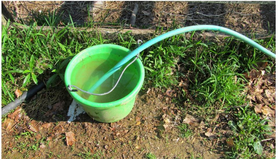
A garden hose submerged into a bucket, or inserted into your car's radiator to flush out antifreeze, or attached to a fertilizer sprayer, could siphon these contaminants back into our water mains.

Common situations where this could occur is during the process of filling a bucket for washing a vehicle, filling a water trough, cleaning equipment, etc. Life is