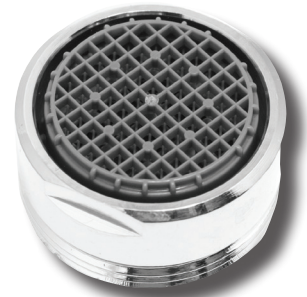
High-efficiency faucet aerators can help save you money.

To make it easy to try a water and energy-saving products, Skagit PUD sells water efficiency kits that contain a WaterSense multi-mode massage showerhead and ultra-efficient faucet aerators for just $11. The kits can be purchased at our main office. Visit SkagitPUD.org for more information about WaterSense-labeled products.